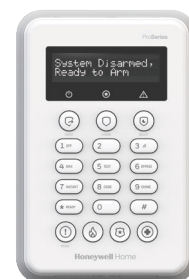
Wireless Touchpad: PROSIXLCDKP